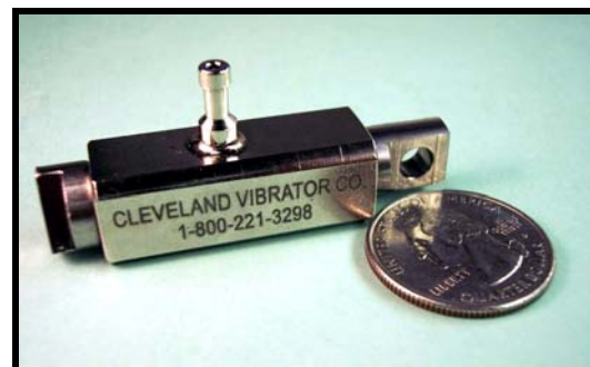
VM-25 Miniature Vibrator all stainless steel