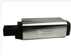
CVC 1/2" SA-EP spring-activated piston air vibrator works on a frequency of 16,000 VPM @ 60 psi; 4.1 bar and air consumption of 3.8 cfm; 108 lpm @60 psi; 4.1 bar.

The popular E-Z Blend granular pigment dispensing system (GDS) has been a company mainstay soon after its founding. The GDS can be designed to meter pigment from up to eight feeding stations to accurately batch hundreds of unique blended pigment formulas. Moving pigment material efficiently out of the feeding stations and onto the weigh vessels requires the use of VMSAC, VMS and SA-EP air piston vibrators from Cleveland Vibratory Company.