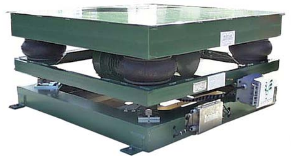
Model FWT Flat Deck Vibratory Weigh Scale Packer

THE CLEVELAND VIBRATOR COMPANY 2828 CLINTON AVE. CLEVELAND, OH 44113 800-221-3298