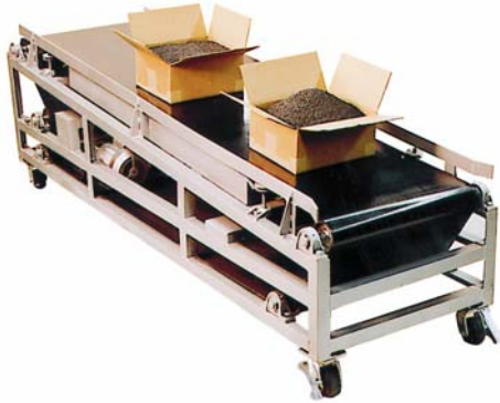
Typical Vibratory Belt Table Conveyor Installation