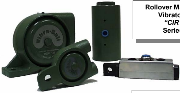
Rollover Machine Vibrators "CIR" Series