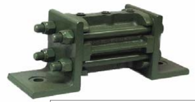
Heavy-duty Double Impact Molding Machine Vibrator "T" series