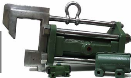
Mold & Core Machine Vibrators "CBS" Series