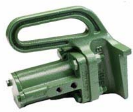
Railroad Car Vibrators Model VMRR and female bracket Model LSRR-FL